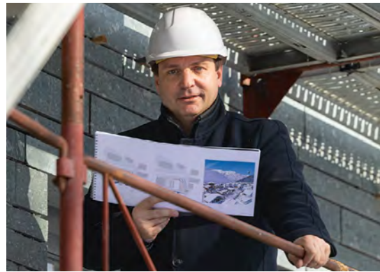
"I SEE MYSELF AS A FERRYMAN"