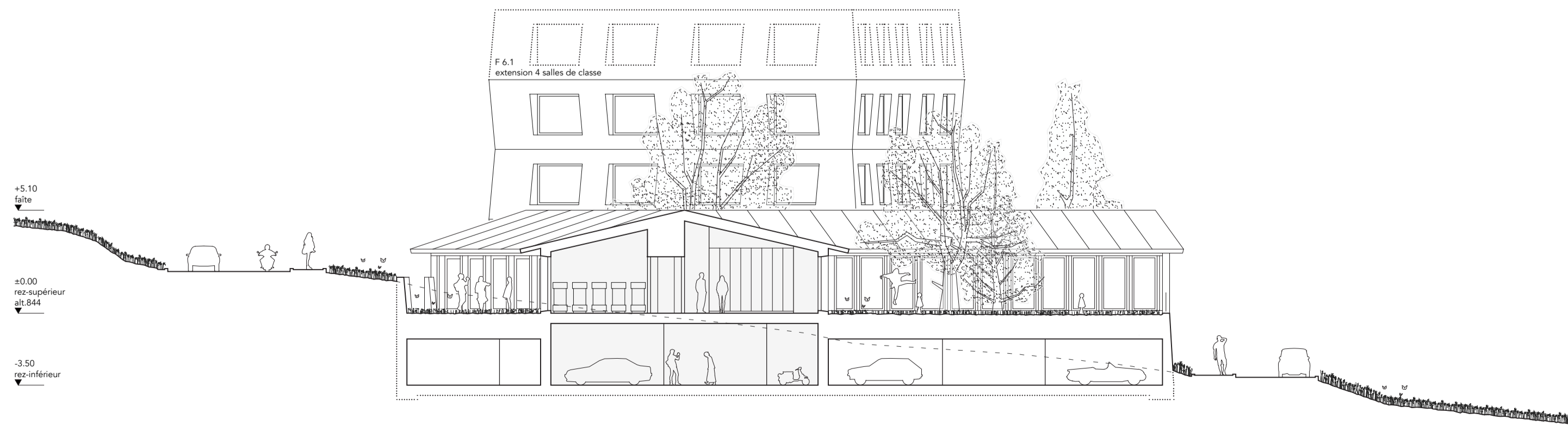
1|200 coupe a-a 1.5m